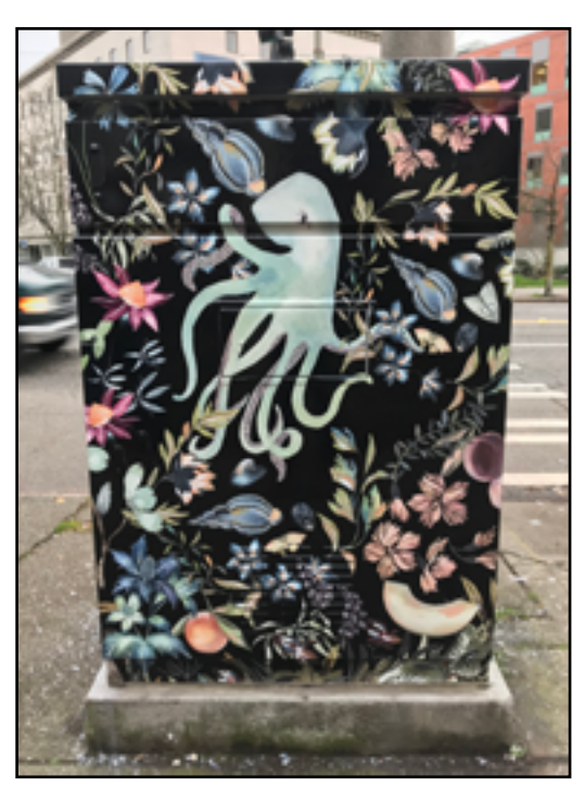
WRAPPED UTILITY BOX ON NW MARKET ST & BARNES AVE NW