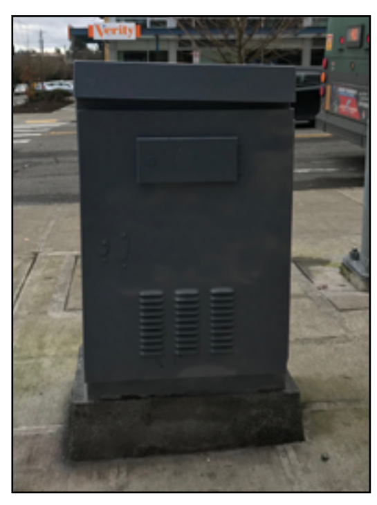
STANDARD UTILITY BOX ON NW 57TH ST & 24TH AVE NW